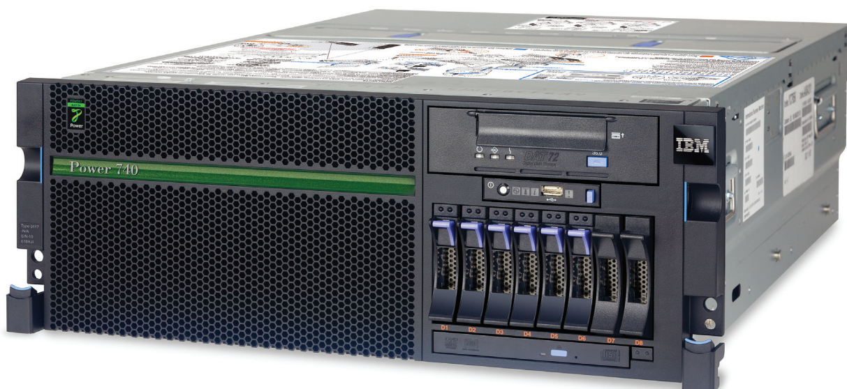
IBM Power 740 Express (rack-mount)